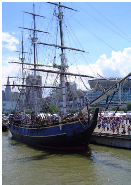
HMS Bounty in Cleveland, OH ~ July, 2003

Wednesday, July 7, 2010 ~ 3:00PM from the Decks of the GOODTIME III